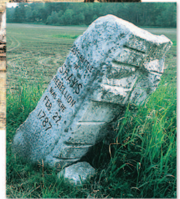
Shays's rebels take over a Massachusetts courthouse. A stone marker rests on the spot of the rebellion.

In January 1787, Shays and his men marched on a federal arsenal, a place to store weapons. The arsenal was defended by 900 soldiers from the state militia. The militia quickly defeated Shays's men. But even though the militia put down Shays's Rebellion , as the uprising came to be known, the farmers won the sympathy of many people. America's leaders realized that an armed uprising of common farmers spelled danger for the nation.