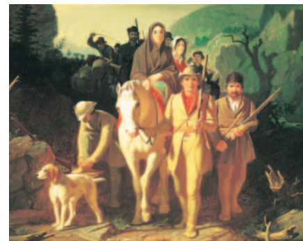
Early travel to Kentucky is shown in this detail of Daniel Boone Escorting Settlers Through the Cumberland Gap (1851–1852) by George Caleb Bingham.

Tensions between Native Americans and settlers led to violent confrontations. But the settlers did not stop coming. By the early 1790s, about 100,000 Americans lived there. While settlers headed into the Western territories, the people in the East began to create new state governments.