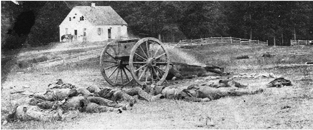
Confederate artillery soldiers lie dead after the Battle of Antietam.

McClellan went on the attack, though he moved slowly as always. On September 17, 1862, at Antietam Creek near Sharpsburg, Maryland, McClellan's army clashed with Lee's. The resulting Battle of Antietam was the bloodiest day in all of American history. A Confederate officer later described the battle.