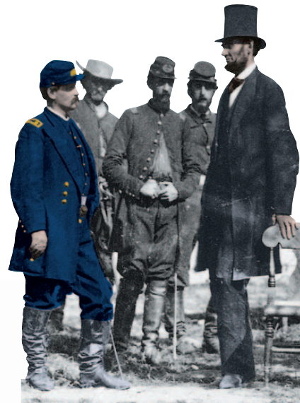
President Lincoln (right) meets with General McClellan (left) on the Antietam battlefield in 1862.

In February 1862, Grant made a bold move to take Tennessee. Using ironclad gunboats, Grant's forces captured two Confederate river forts. These were Fort Henry on the Tennessee and Fort Donelson on the nearby Cumberland. (See map on next page.) The seizure of Fort Henry opened up a river highway into the heart of the South. Union gunboats could now travel on the river as far as northern Alabama. When the people of Nashville, Tennessee, heard the forts were lost, they fled the city in panic. A week later, Union troops marched into Nashville.